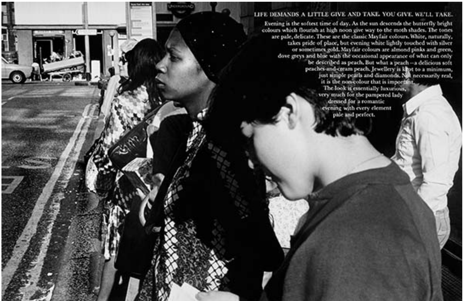
Victor Burgin, UK 76 (detail), 1976

some composed by the artist, some deadpan, and some florid—placed above an image, each wonderfully reminiscent of film noir in their monochromatic grandeur and allusions to surveillance and violence. Though straightforward, these texts have a lyrical and poetic quality that, no matter their source, becomes strangely poignant. The texture of the paste also lends a corporeal element, as if a very thin skin has affixed the images; in a reference to the original presentation of UK76 four decades ago, the images will be scraped from the walls when the exhibition closes.