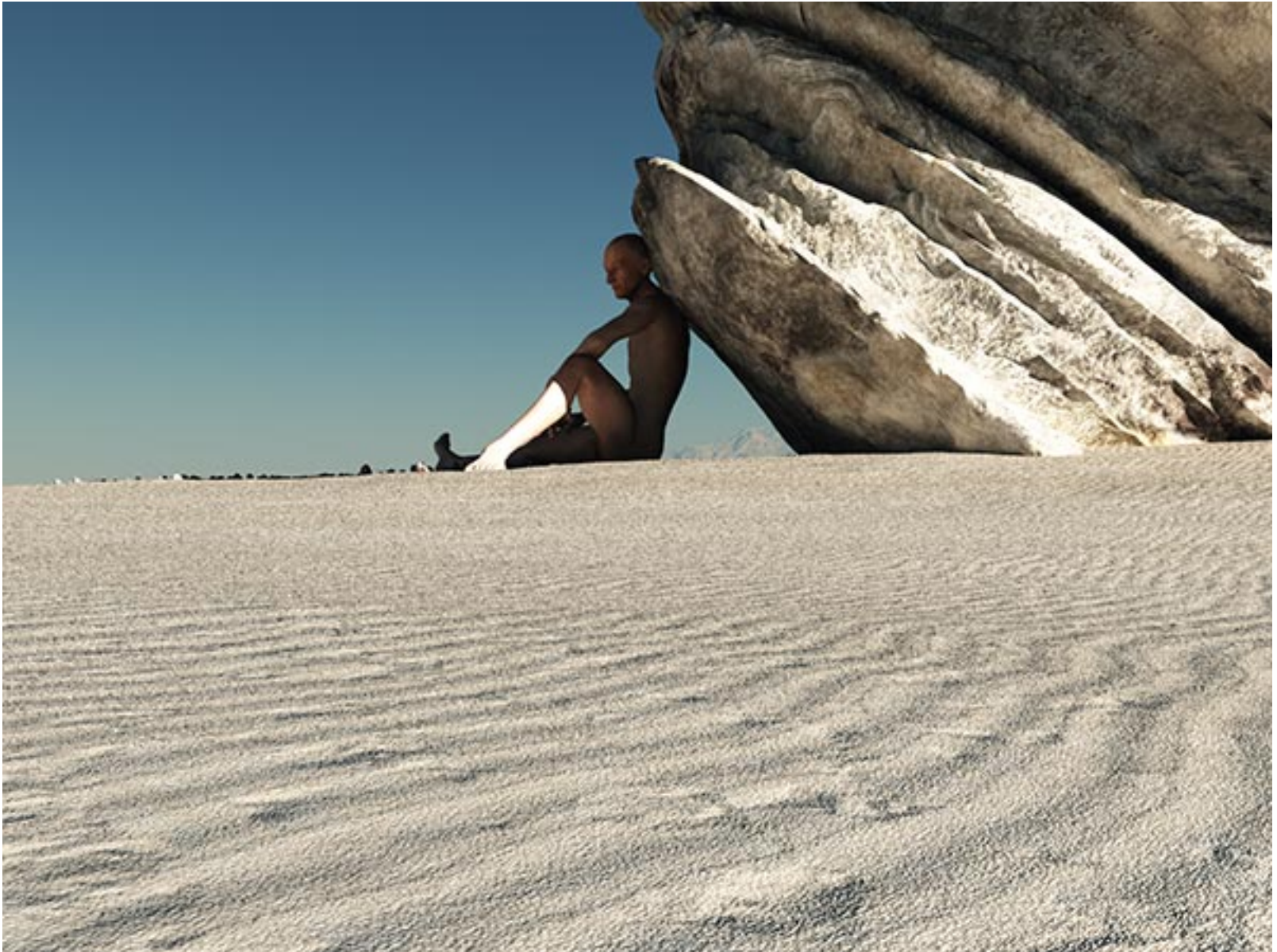
Victor Burgin, Still from Mirror Lake, 2013. Digital projection, 14:37 minutes

No one is associated more forcefully with a cool academicism than Victor Burgin. His highly theoretical writing, as well as his pioneering use of politically inflected text in photography and video, has been a hallmark of Conceptual art since the early 1970s. However, Conceptual art, in foregrounding its ideas in self-referential forms, is usually understood as devoid of energetic, activist politics. In a recent review in Artforum of John Baldessari's exhibition at Sprüth Magers in Los Angeles, for example,