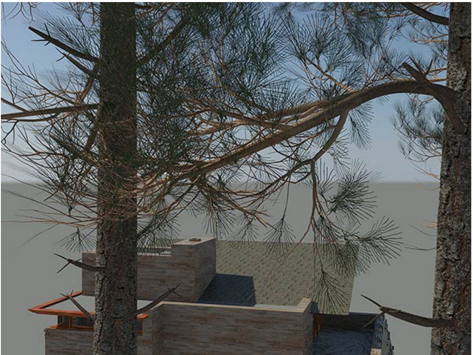
Victor Burgin, Still from Prairie , 2015. Digital projection, 8:03 minutes Courtesy the artist and Cristin Tierney Gallery, New York.

lady dressed for a romantic evening with every element pale and perfect." But, are the unsubtle allusions to whiteness ("pampered lady"; "pale and perfect") incongruous with the photograph's black, presumably working-class protagonist? Like any advertisement, the first instinct is to read the text and image as related, despite their obvious dissonance. Yet this isn't some valorization of the working class, or an elevation of the humdrum daily commute to the status of poetry. We are swept up in beautifully saccharine imagery—we believe the drama—until we discover that the directive to feel moved comes not from true emotion, but from advertising.