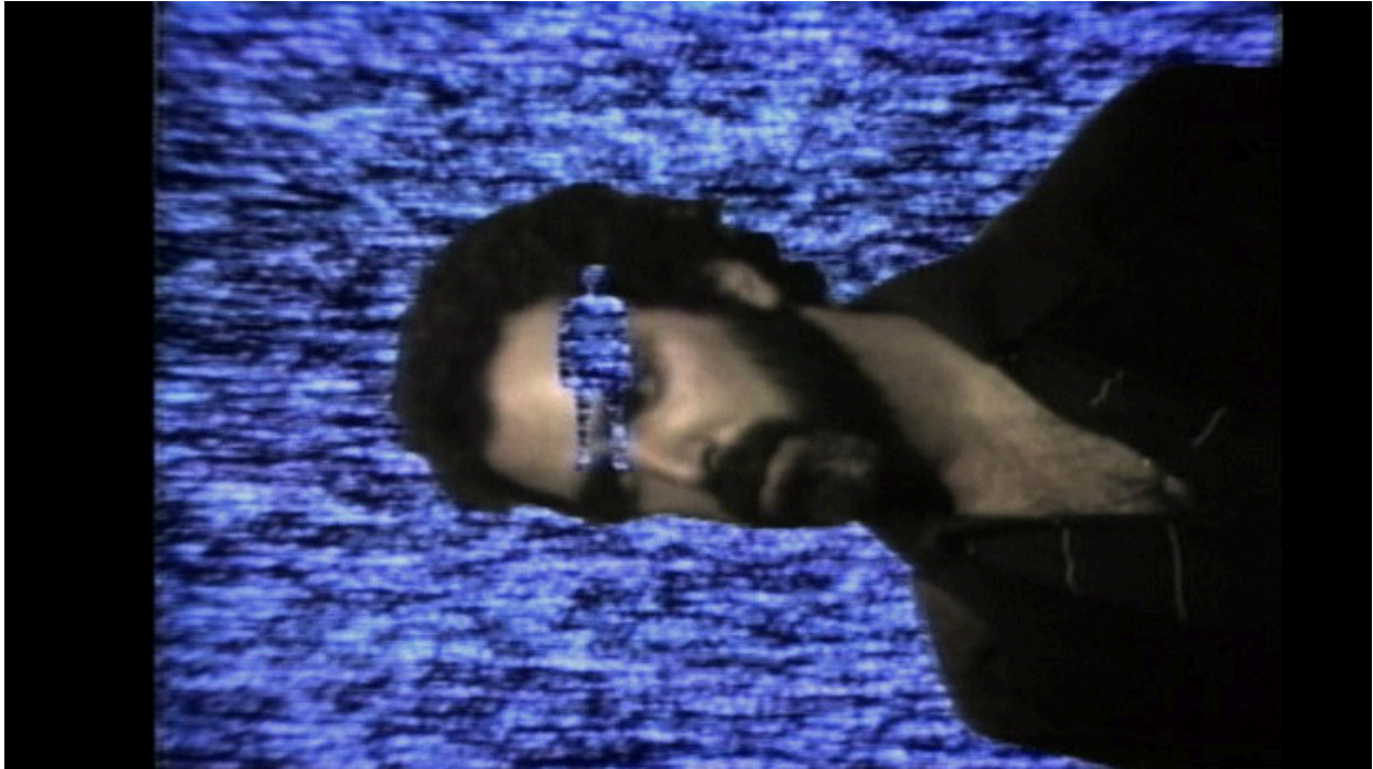
Peter Campus, Set of Coincidence, 1974, Courtesy the artist and Cristin Tierney Gallery © Peter Campus 2017.

The first part of the Jeu de Paume exhibition is focused on the experimental video installations created by Peter Campus. He explores the notions of spatial awareness, one's perception of self and body, and their impact on the construction of identity. In these video installations that are amazingly surreal and strangely unsettling, Campus uses closed circuits, unusual perspectives and multiple timeframes, to transmit the electronic images of the viewer on screen. The result is a strange confrontation with self, as the viewers find themselves displaced in time or space, or both. Peter Campus also explores the psychological and cognitive dimension of projected images in a series of videos that seem as surreal as a Magritte painting.