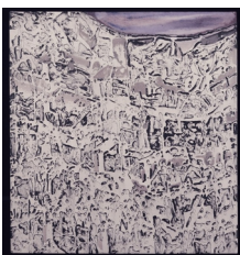
Jorge Tacla Rubble 17 , 2010 acrylic, oil and marble powder on canvas 36 x 34 inches (91.4 x 86.4 cm) (CT-255)