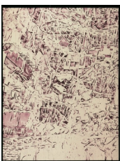
Jorge Tacla Rubble 21 , 2010 acrylic, oil and marble powder on canvas 80 x 60 inches (CT-251)