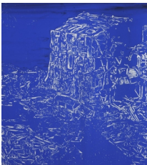
Jorge Tacla Altered Remains 4 , 2011 acrylic, oil and marble powder on canvas 63 x 57 inches (160 x 144.8 cm) (CT-482)