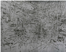
Jorge Tacla Altered Remains 2 , 2011 acrylic, oil and marble powder on canvas 72 x 90 inches (182.9 x 228.6 cm) (CT-445)