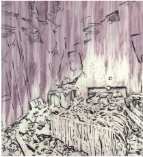
Jorge Tacla The Rubble Bed of b and b , 2011 acrylic, oil and marble powder on canvas 66 x 61 inches (167.6 x 154.9 cm) (CT-460)