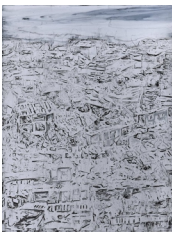
Jorge Tacla Altered Remains 3 , 2011 acrylic, oil and marble powder on canvas 80 x 60 inches (203.2 x 152.4 cm) (CT-446)