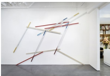
Richard Galpin Dog Everything , 2015 steel dry-lining channel, acrylic paint 133.86 x 169.29 x 4.92 inches (340 x 430 x 12.5 cm) (CT-4993)