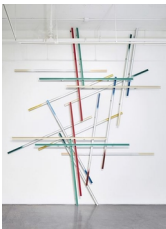
Richard Galpin Travel Both Tracks , 2015 steel dry-lining channel, acrylic paint 165.35 x 179.92 x 4.92 inches (420 x 457 x 12.5 cm) (CT-4994)