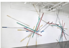
Richard Galpin Travel To Me / Travel From Me , 2015 steel dry-lining channel, acrylic paint 179.92 x 381.89 x 4.92 inches (457 x 970 x 12.5 cm) (CT-4995)