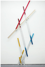
Richard Galpin Jib Up , 2015 steel dry-lining channel, acrylic paint 120.08 x 51.18 x 4.92 inches (305 x 130 x 12.5 cm) (CT-4996)