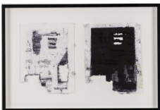
Tim Youd Philip K. Dick's A Scanner Darkly , 2013 typewriter ink on paper framed: 17 x 25 inches (43.2 x 63.5 cm) (CT-5564)