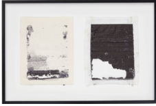
Tim Youd Flannery O'Connor's The Violent Bear It Away , 2016 typewriter ink on paper framed: 17 x 25 inches (43.2 x 63.5 cm) (CT-5670)

Tim Youd: Ecstatic Reading Exhibition Checklist July 13 - August 18, 2017