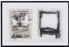
Tim Youd Patricia Highsmith's The Talented Mr. Ripley , 2017 typewriter ink on paper framed: 17 x 25 inches (43.2 x 63.5 cm) (CT-5911)