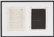
Tim Youd Jack Kerouac's Big Sur , 2015 typewriter ink on paper framed: 17 x 25 inches (43.2 x 63.5 cm) (CT-5671)