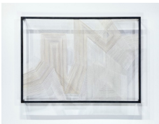
Alois Kronschlaeger Untitled, 2017 aluminum mesh, Merino wool 32 x 44 x 5 inches (81.3 x 111.8 x 12.7 cm) (CT-5913)