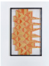
Alois Kronschlaeger Untitled, 2017 aluminum mesh, Merino wool 20 x 30 x 1 inches (50.8 x 76.2 x 2.5 cm) (CT-5915)