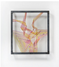
Alois Kronschlaeger Untitled, 2017 aluminum mesh, Merino wool 16 x 18 x 1 inches (40.6 x 45.7 x 2.5 cm) (CT-5934)