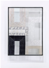
Alois Kronschlaeger Untitled, 2017 aluminum mesh, Merino wool 44 x 32 x 5 inches (111.8 x 81.3 x 12.7 cm) (CT-5912)