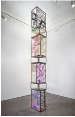
Alois Kronschlaeger Modular Structure #1, 2017 aluminum mesh, Merino wool, steel approximately 109 1/2 x 17 3/4 x 17 3/4 inches (278.1 x 45.1 x 45.1 cm) (CT-6027)