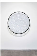
Alois Kronschlaeger Untitled, 2018 aluminum mesh, carbon steel, Merino wool 48 inches (121.9 cm) diameter (CT-6066)