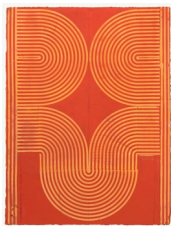
Elise Ferguson JM , 2017 pigmented plaster on panel 24 x 18 inches (61 x 45.7 cm) (CT-6063)