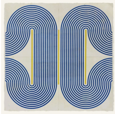
Elise Ferguson Bristol , 2018 pigmented plaster on panel 24 x 24 inches (61 x 61 cm) (CT-6060)