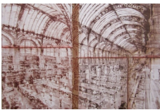
Jorge Tacla Señal de Abandono 11 , 2016 oil and cold wax on canvas 40 x 60 inches (101.6 x 152.4 cm) (CT-5410)