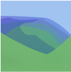
Helen Lundeborg Blue Mountain , 1967 acrylic on canvas 40 x 40 inches (101.6 x 101.6 cm) (CT-5406)