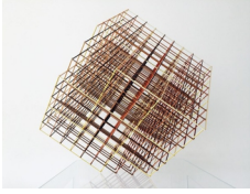
Alois Kronschlaeger Untitled, 2015 basswood, ink 24 x 24 x 24 inches (61 x 61 x 61 cm) (CT-2456)