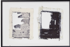
Tim Youd John Rechy's City of Night , 2016 typewriter ink on paper framed: 17 x 25 inches (43.2 x 63.5 cm) (CT-5667)