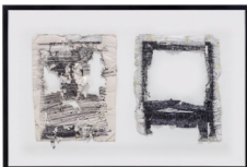
Tim Youd Patricia Highsmith's The Talented Mr. Ripley , 2017 typewriter ink on paper framed: 17 x 25 inches (43.2 x 63.5 cm) (CT-5911)