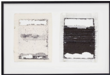
Tim Youd Flannery O'Connor's Wise Blood , 2016 typewriter ink on paper framed: 17 x 25 inches (43.2 x 63.5 cm) (CT-5669)