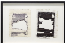
Tim Youd Ernest Gaines's The Autobiography of Miss Jane Pittman , 2015 typewriter ink on paper Framed size: 17 x 25 inches (43.2 x 63.5 cm) (CT-6921)