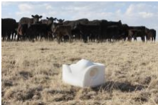
Malia Jensen High Noon (Right) , 2011 digital pigment print 20 x 30 inches (image), 23.5 x 33.5 inches (paper) edition of 10 (CT-776)