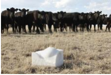
Malia Jensen High Noon (Center) , 2011 digital pigment print 20 x 30 inches (50.8 x 76.2 cm) edition of 10 (CT-774)