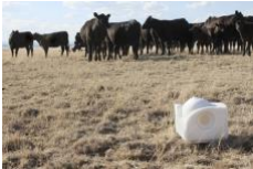
Malia Jensen High Noon (Left) , 2011 digital pigment print image: 20 x 30 inches (50.8 x 76.2 cm) edition of 10 (CT-775)