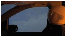
T. Kelly Mason Space Film , 2019 HD video 43:26 minutes edition of 3 + 1 AP (CT-6527)