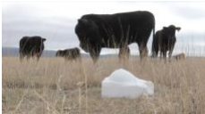
Malia Jensen Salty , 2010 digital video 13:14 minutes edition of 10 + 1 AP (CT-6038)