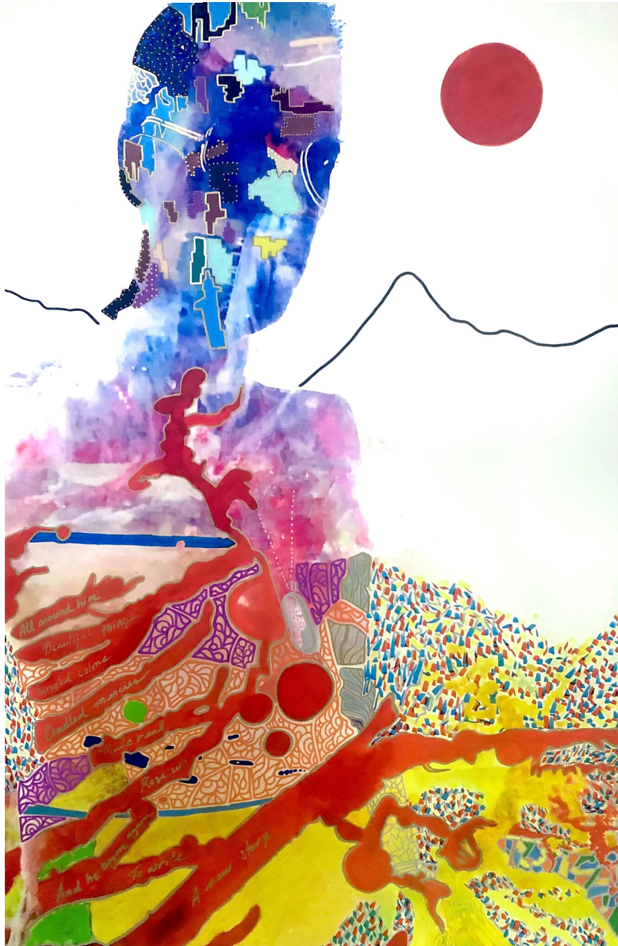
A self-portrait by Hunter Biden.