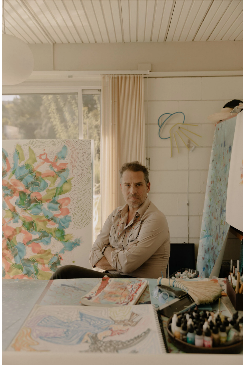
Hunter Biden at his studio in Los Angeles.