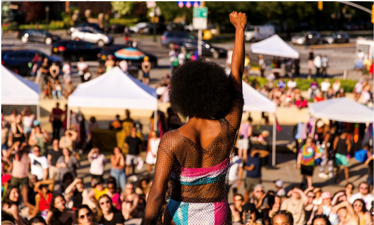
Brooklyn Pride.