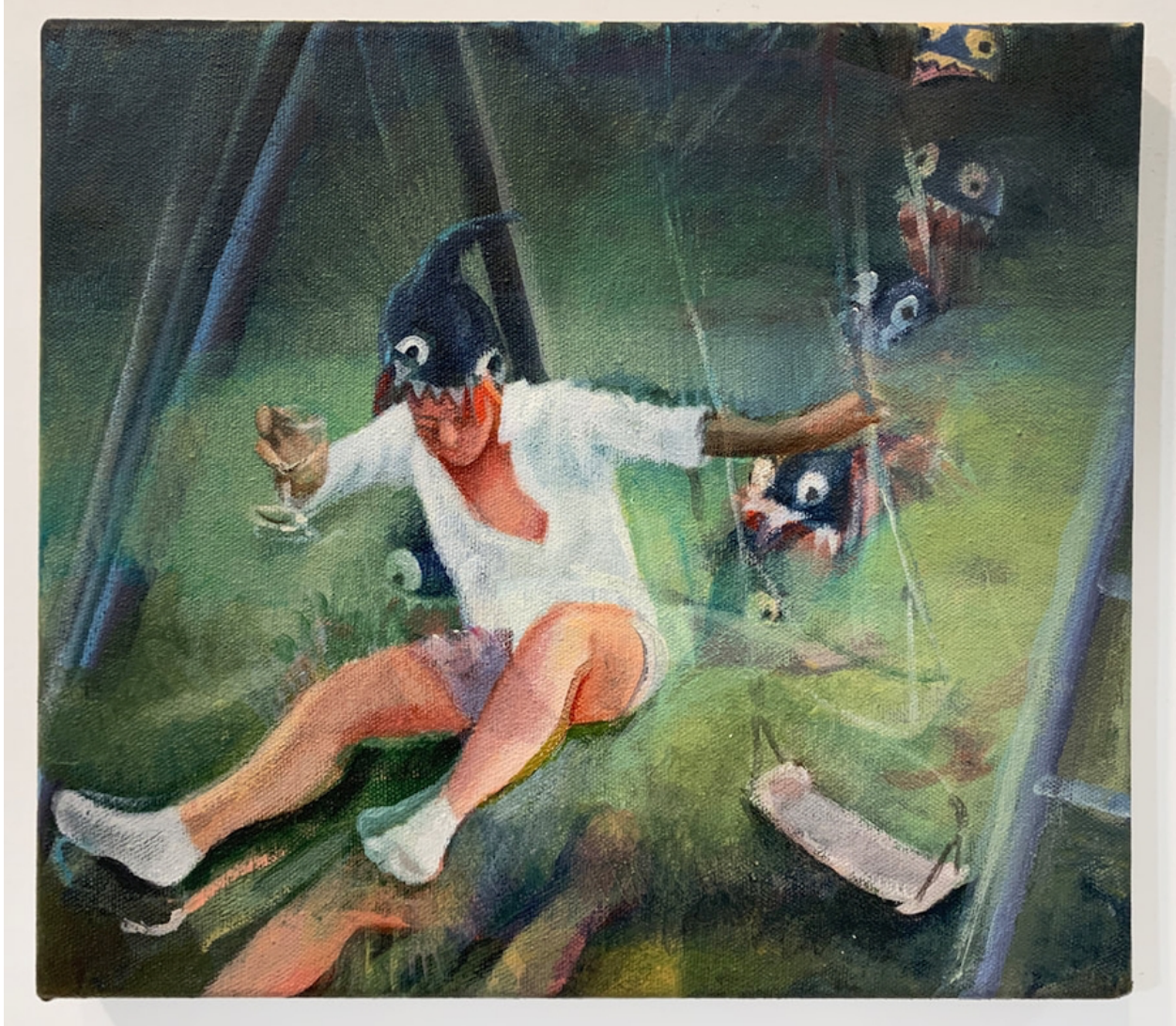
Claudia Bitrán, On wine , 2020, acrylic on canvas, 25.5 x 28 cm.

Bitrán's paintings reveal the ghostly metamorphosis of the original material, while the animations serve as documentation of the evolutionary stages of the paintings. The process is empathic and, at the same time, revealing of grotesque and abysmal behaviors, of the complexities, pressures and anguish of adolescence, in a present where the viralization of private life on the Internet has been exacerbated by the pandemic.