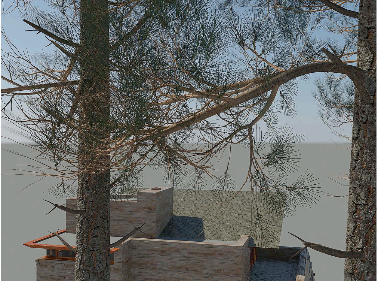
Victor Burgin, Mirror Lake , 2013. digital projection work. 14:37 minutes. edition 1 of 3 + 1 AP.