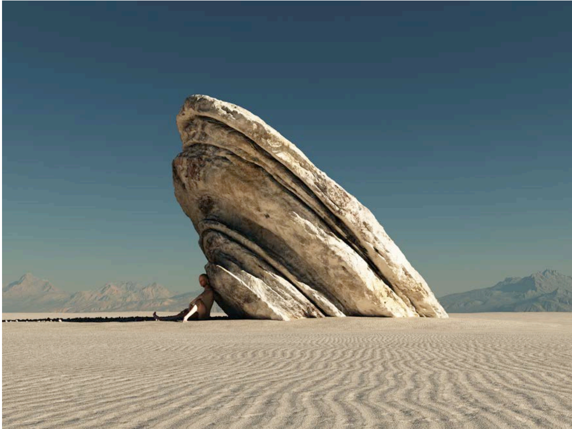
Victor Burgin, Mirror Lake , 2013. digital projection work. 14:37 minutes. edition 1 of 3 + 1 AP.