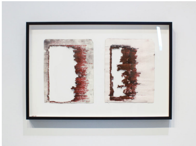
Tim Youd, Elizabeth Bishop's The Complete Poems: 1927 – 1979, 2018

Earlier in March, New York City hosted the annual “Armory Week”, with thousands of contemporary artworks occupying multiple massive art fairs across the city. Design Milk ran through 6 of the biggest art fairs to find the most creative and eye-catching artworks on view. Here’s a recap of our “Top 9”, in the order of their discovery.